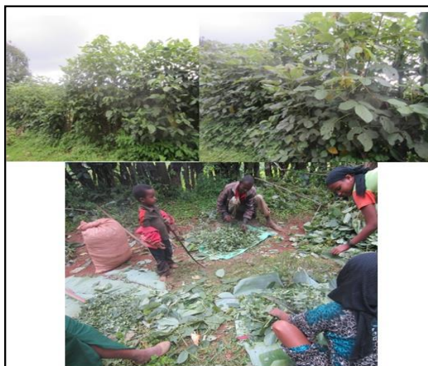
Figure 2: Erythrina Spp. Planted as fencing and family based chopping it into pieces for incorporation to soil in the area

Farmers who have land holding in the study area uses Erythrina species as farm boundary (Figure 2) although its socio-economic evaluation is not yet done. The reason for using as a fence is that its spiny bark protects animals from entering in to agriculture field. Some farmers also use it for preparation of bee hives at its large tree wood stage by cutting (logging down) it after 4-5 years of planting. Although the aforementioned advantages were primary uses that farmers know, its role in terms of soil fertility management by chopping young leaves and twigs and incorporating to soil was not known in the area and therefore, this experiment was applied and produced the result shown at Table 2.